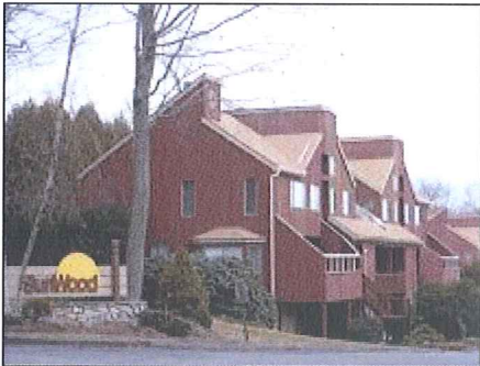
OSHA finds safety violations in worker's death

with light-emitting diode screens and use a camera feed to project the image of the surrounding area onto the aircraft.